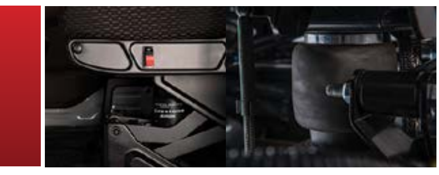
Layers of air between you and the bumpy road. Air suspension drivers seat and the Link Cabmate<sup>®</sup> Air suspension cab are both STANDARD.

Driver retention is tough. Bluetooth Radio w/CD player, Air ride drivers seat, USB charging port, A/C, cruise control, tilt & telescopic steering wheel, will help. Thats why it's STANDARD.